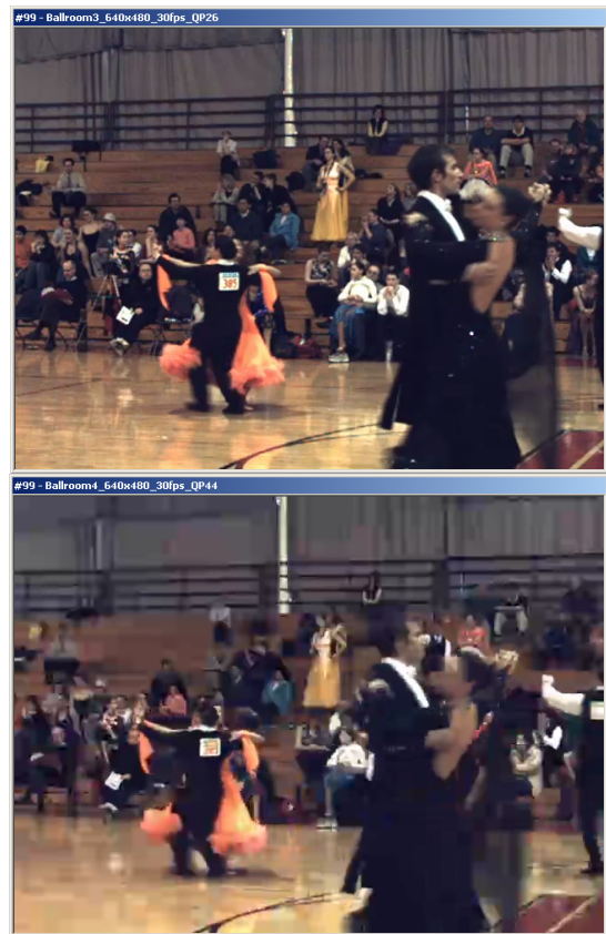
Figure 3. Snapshots of the right view coded at a low quality (above) and left view coded at a high quality (below)